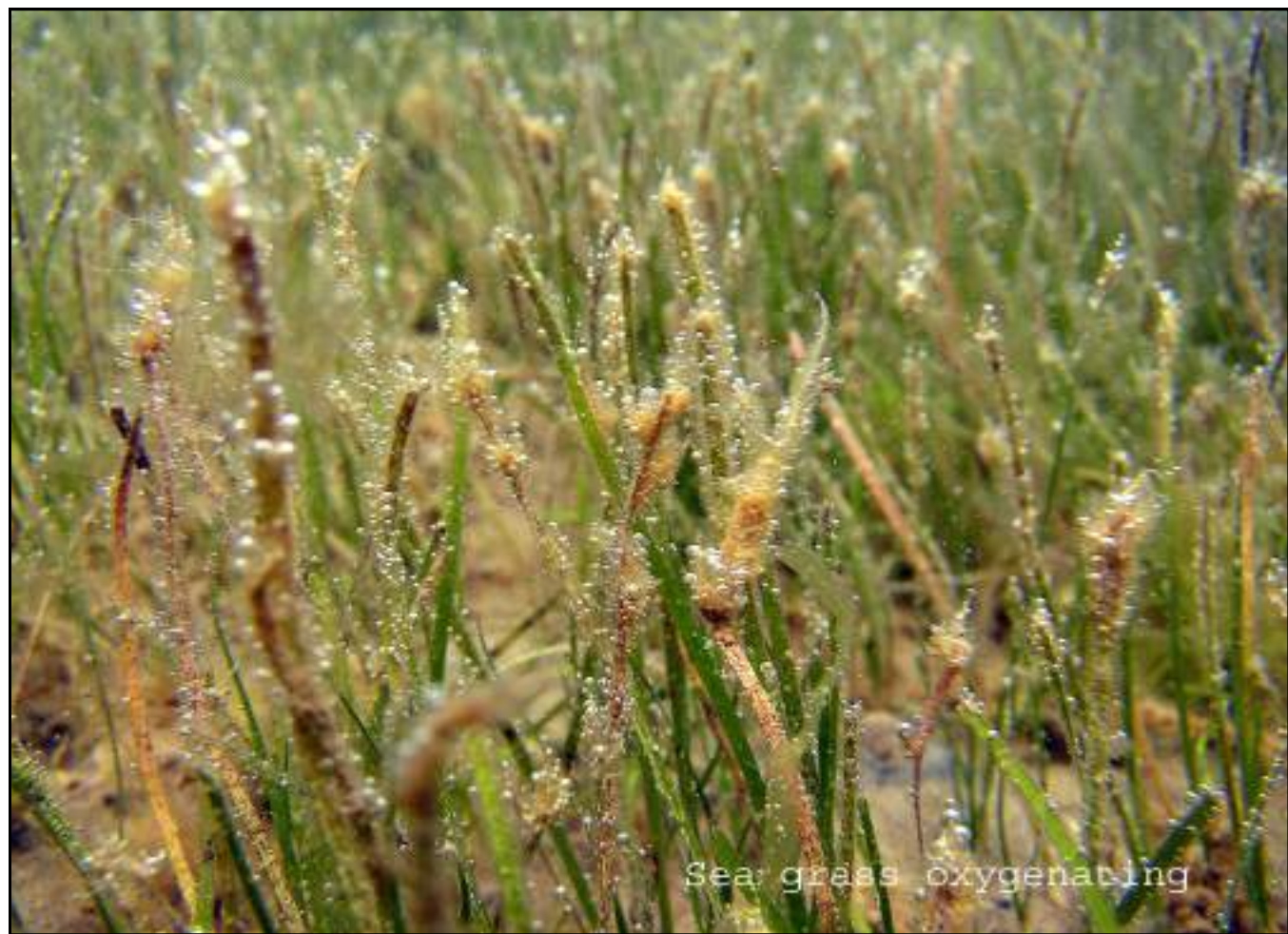
Sea grass oxygenating