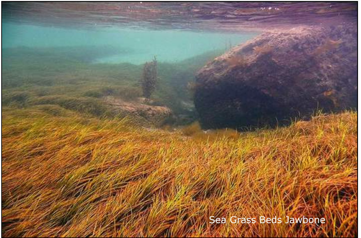
Sea Grass Beds Jawbone