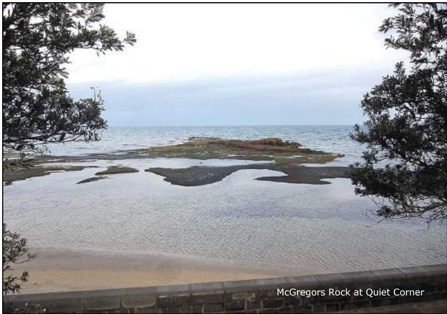
McGregors Rock at Quiet Corner