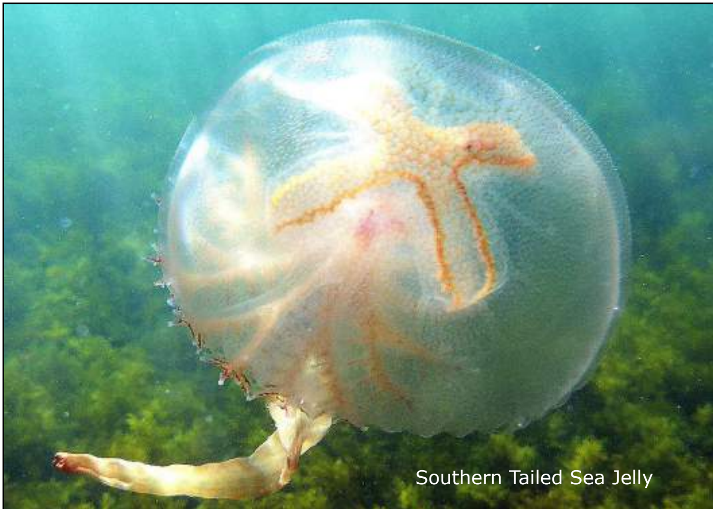
Southern Tailed Sea Jelly