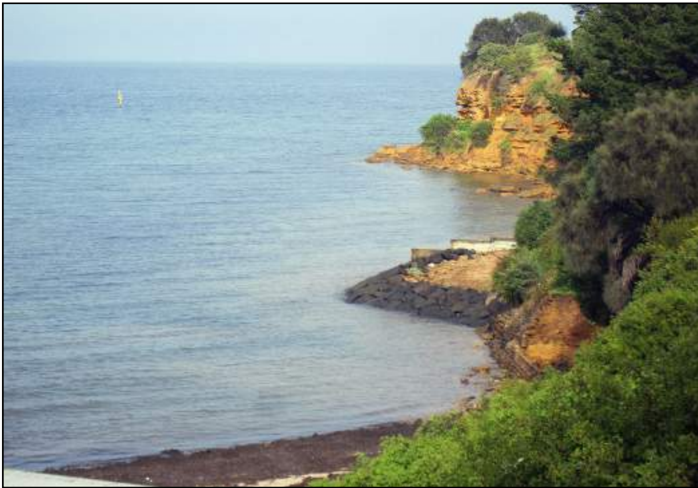
Fossil Beach Cromer Rd. North of BMYC