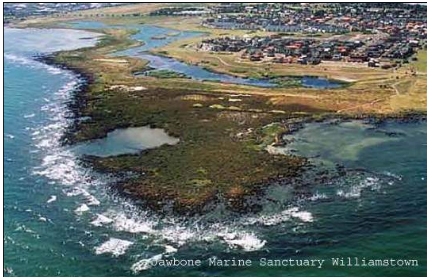
Jawbone Marine Sanctuary Williamstown