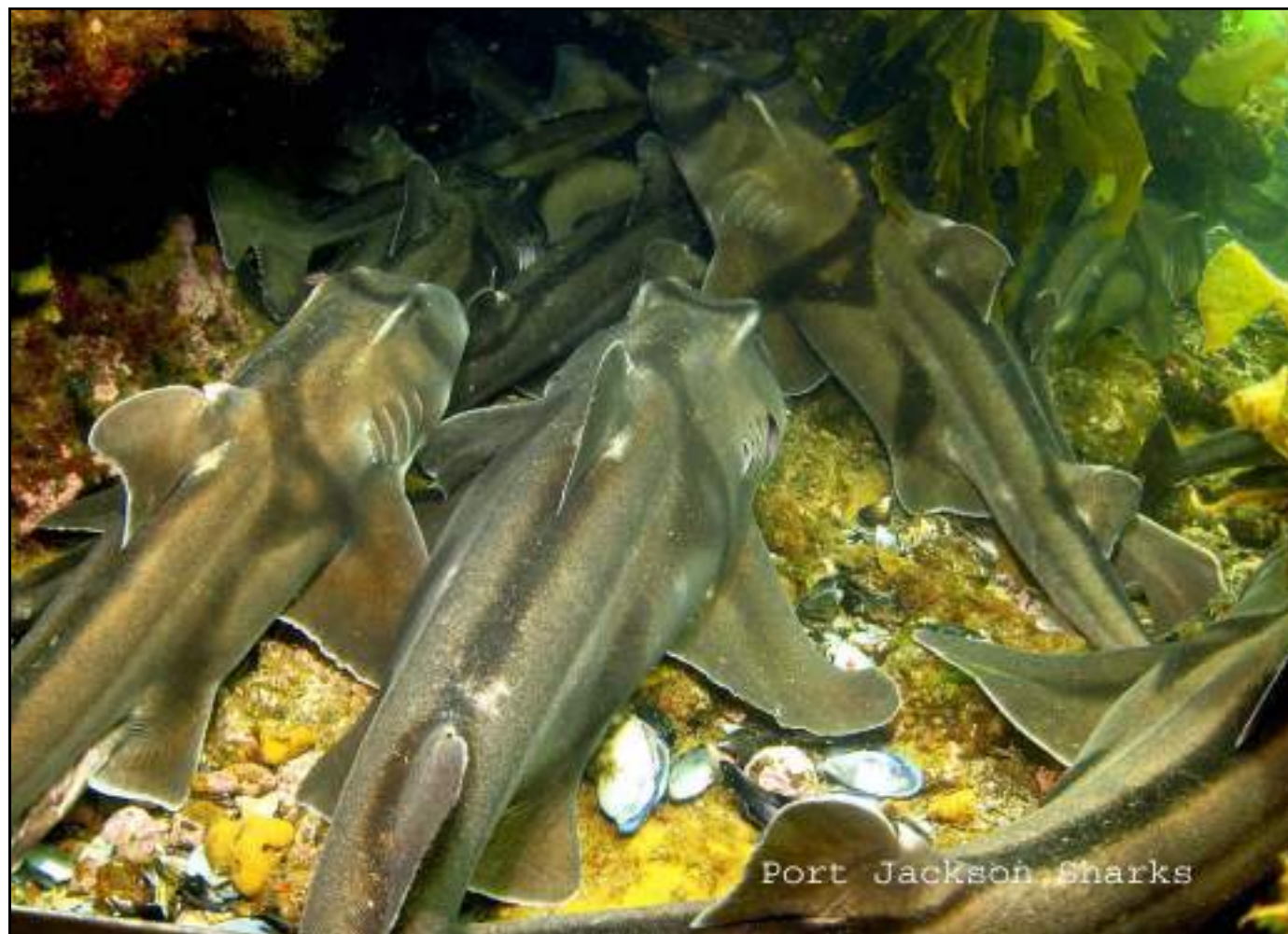
Port Jackson Sharks