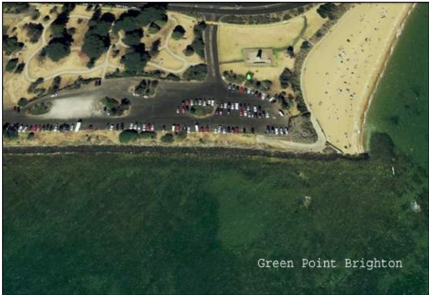
Green Point Brighton