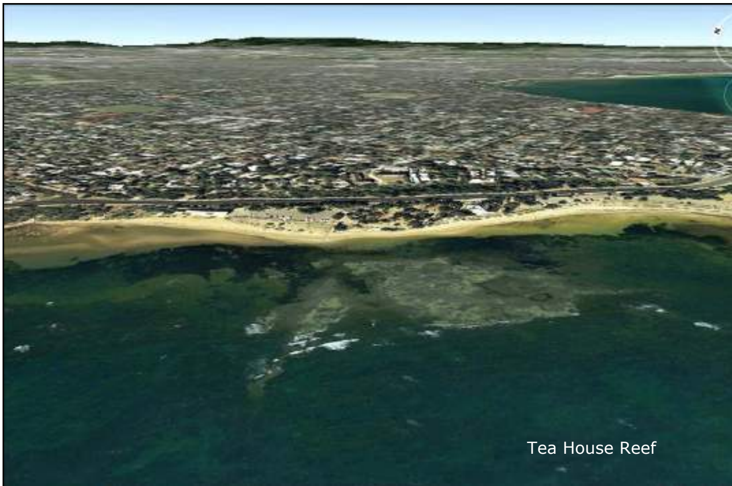
Tea House Reef