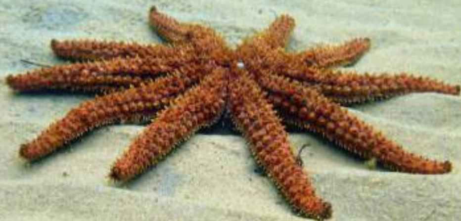
Australian 11 Armed Sea Star