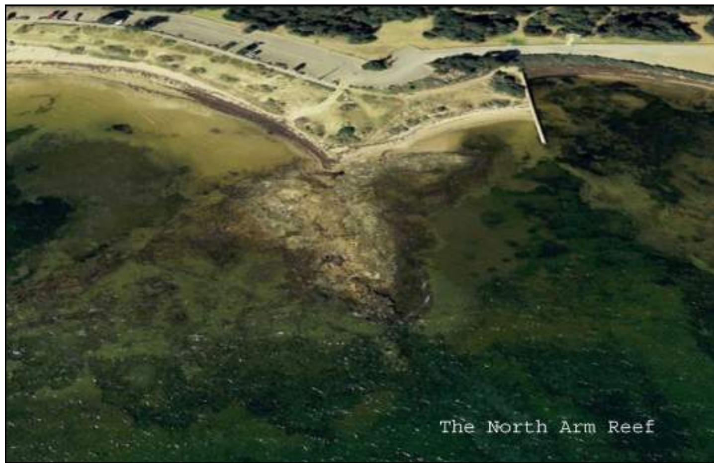
The North Arm Reef