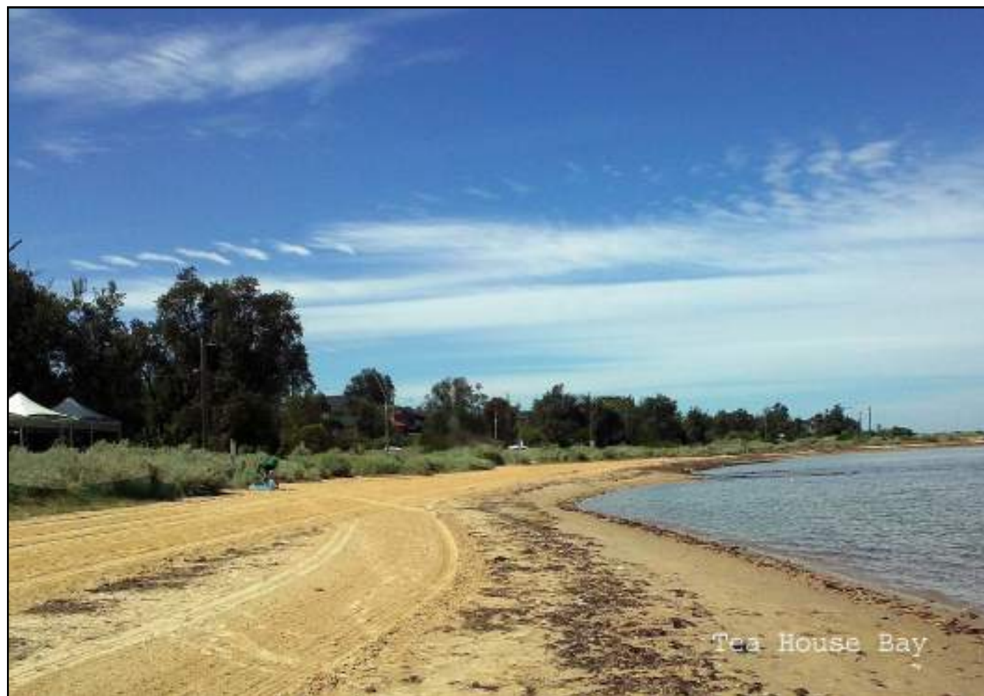
Tea House Bay