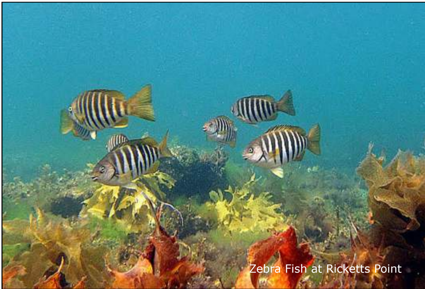
Zebra Fish at Ricketts Point