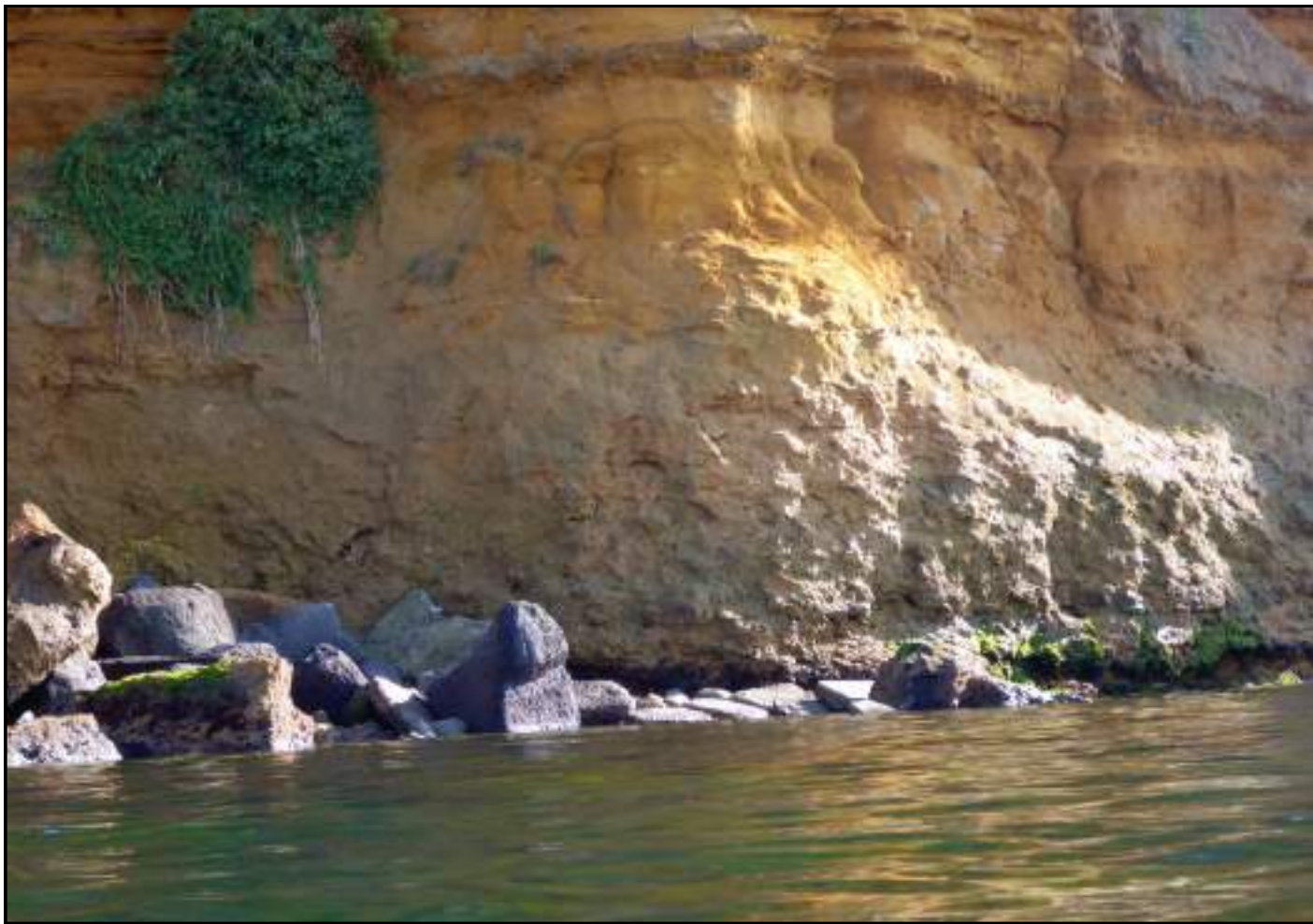
Cromer Rd South of the BMYS