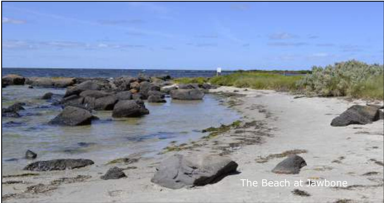
The Beach at Jawbone

The water in the bay at Jawbone and on the route shown, will be shallow, especially at low tide, and no deeper than 3 m. Among the beautiful things to be seen here are the shallow but lush seagrass beds where one might find elusive pipefish, and both dumpling and pygmy squid.