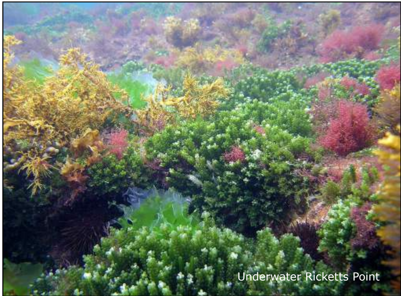
Underwater Ricketts Point