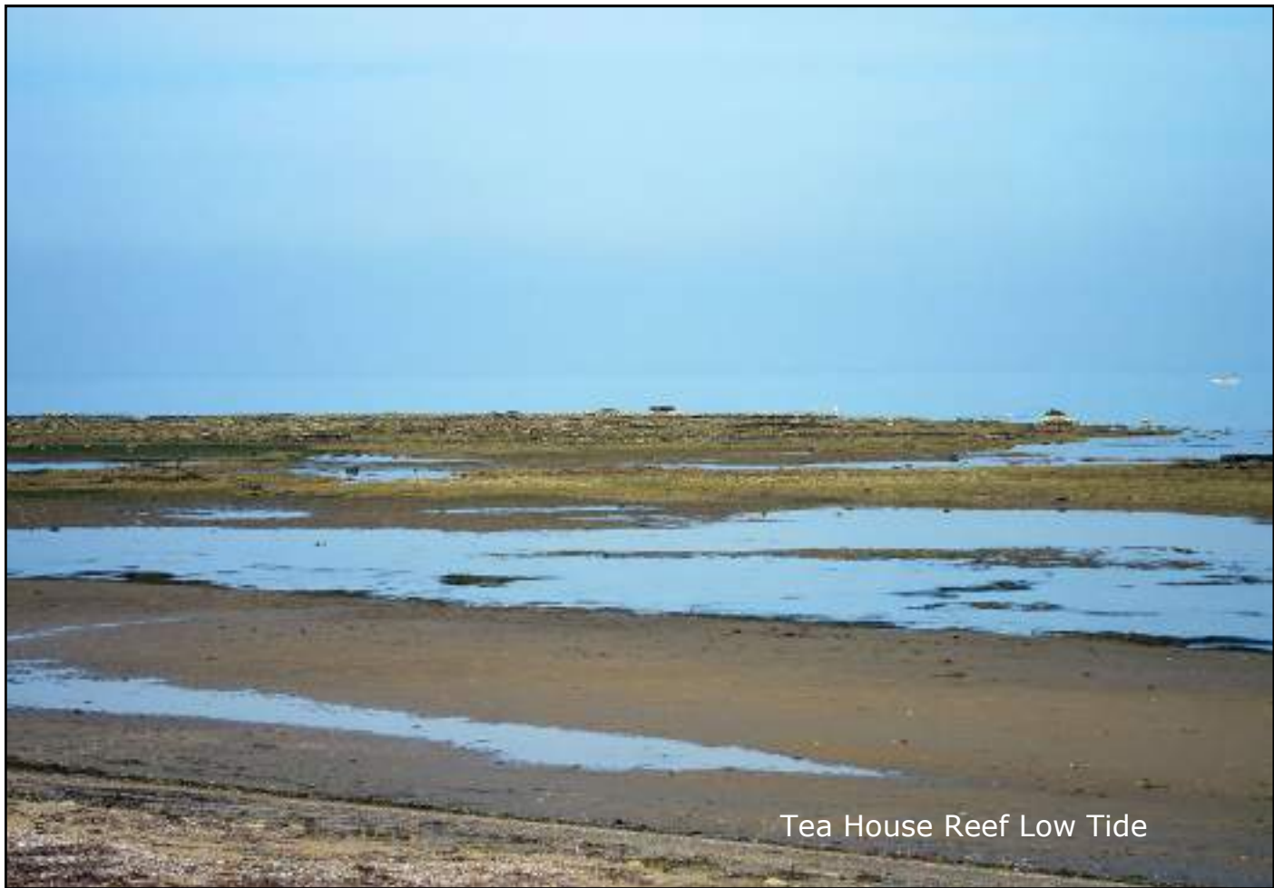
Tea House Reef Low Tide