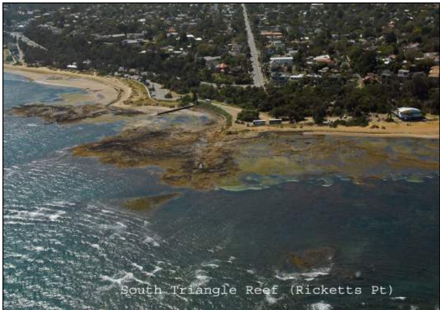
South Triangle Reef (Ricketts Pt)