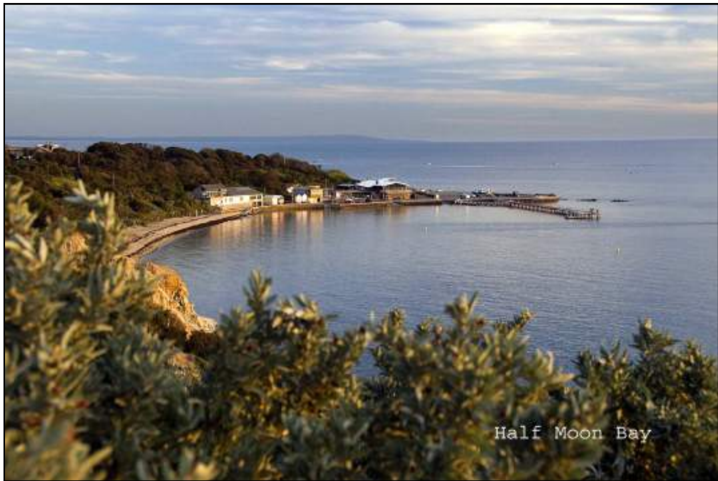
Half Moon Bay