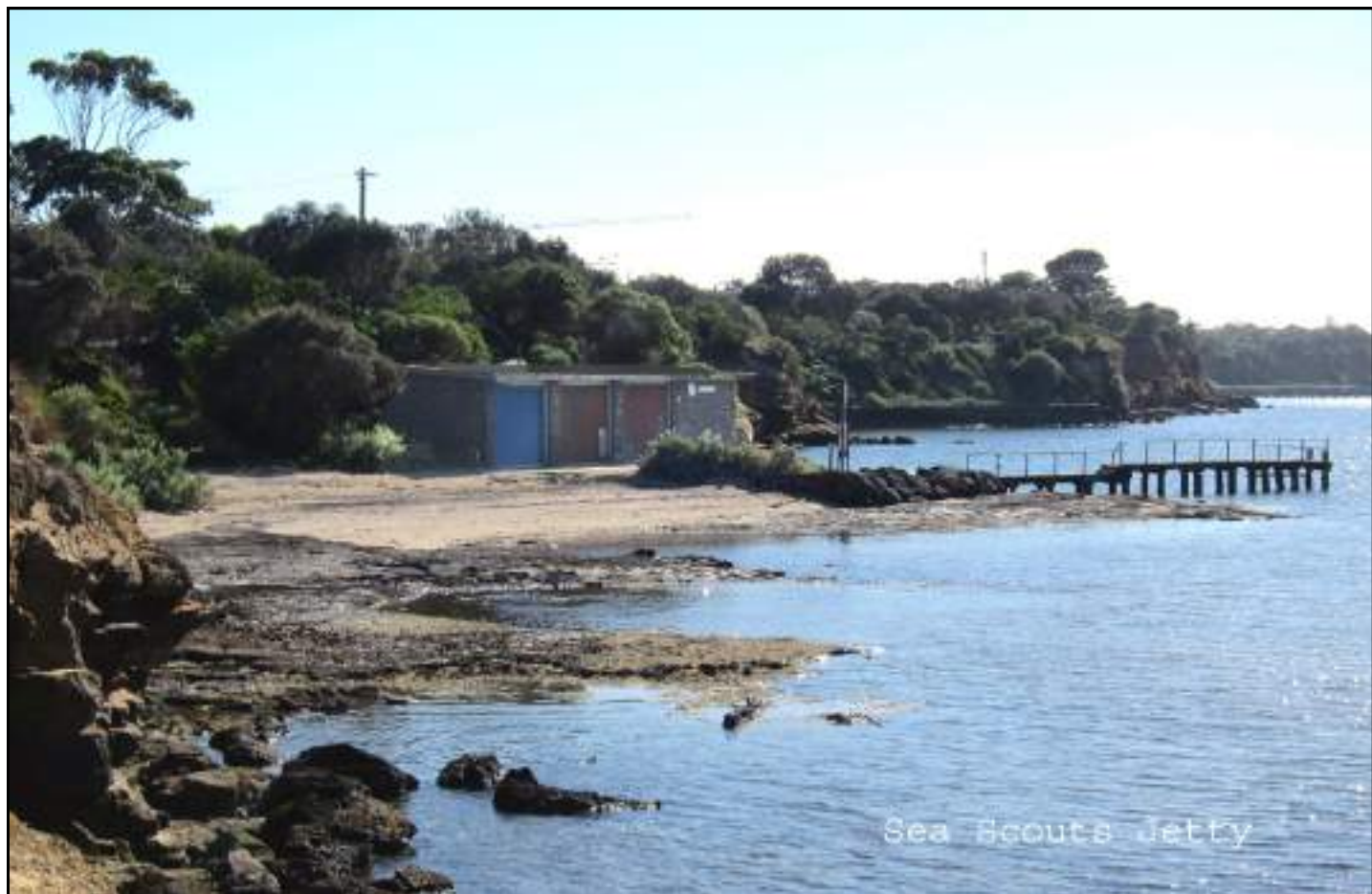
Sea Scouts Jetty