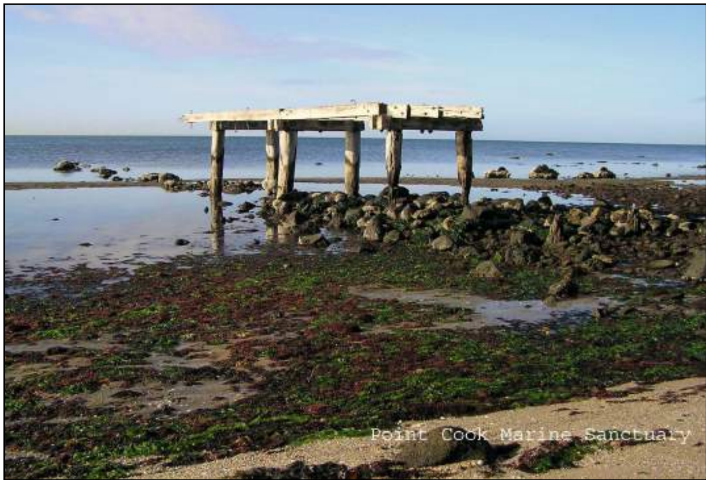
Point Cook Marine Sanctuary